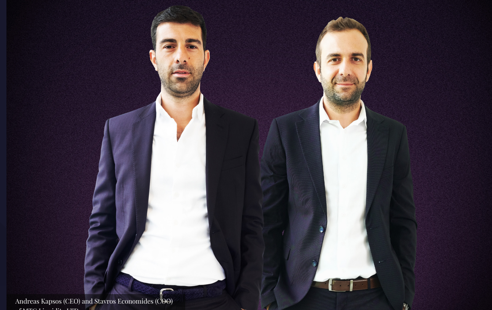
of MTG Liquidity LTD

We adopted this strategy of not selling liquidity but becoming the broker's partner. All of the people behind Match-Prime have extensive experience in working at the biggest brokers in Europe. We have dealt with the LPs' sales reps pressuring us to increase the number of transactions, we know how frustrating it is, and that's definitely not how we want to do our business. I'm pretty confident about our offer and service, and I'm sure that once a client tries it, they'll start trading at some point. Even if they connect just to diversify their liquidity sources. We care about establishing a relationship with our clients and helping them grow. That's what I believe will bring us the most benefit.